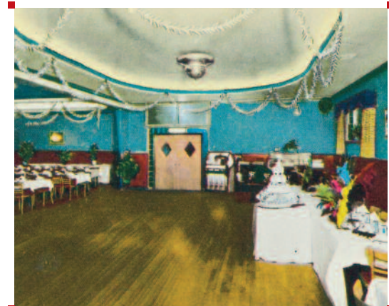
Top half of a postcard of the Blue Point Lounge, 8th Street and Willow Avenue, Hoboken, ca. 1955.

[And then my father found work on the docks.] You start dishwashing, then you talk to your neighbor. “What do you do?” “Oh, I work here.” Then you talk to your other friends. So my father worked as a longshoreman, here on First Street, when the ships came in.