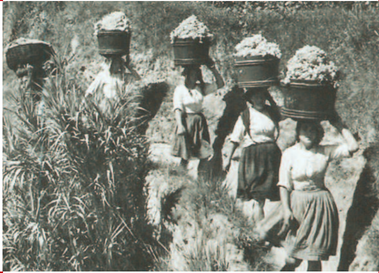
Susak women carrying grapes they've harvested, ca. 1960.