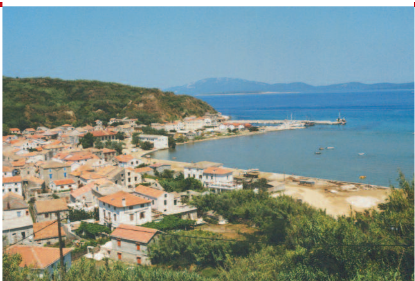
The lower section of Susak, Croatia, ca. 2000.