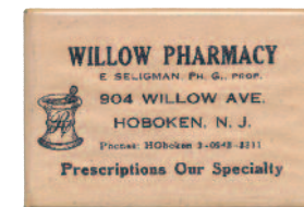
Pocket mirror advertising Willow Pharmacy, 904 Willow Avenue, Hoboken, ca. 1960.

to meet down by the drugstore, Willow Pharmacy, Ninth Street and Willow Avenue. It's still there. You'd go call your girlfriend inside the booth, where your parents don't hear you. [We had a phone at home], but you've got to go over there, [to the drug store, for privacy]. There used to be like five of us waiting for the little phone booth.